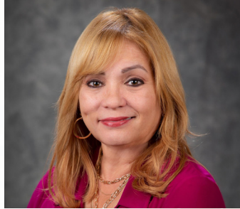
District 4 Commissioner The Honorable Maribel Gomez Cordero